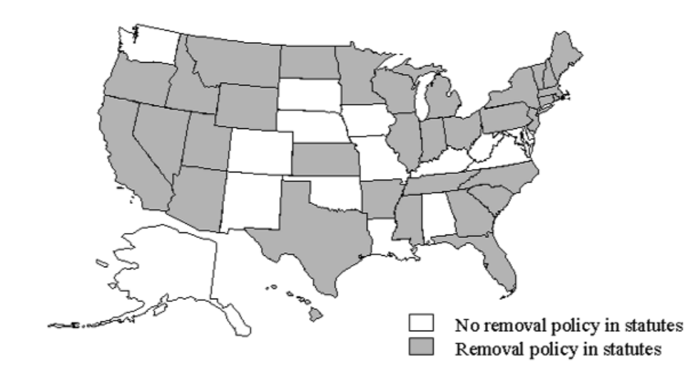
Fig. 2. Summary of state statutes dealing with dam removal. States with/without explicit mention of dam removal in statutes. Information on statutes was collected from reviews of state codes relevant to dams and waterways, and by contacting cognizant personnel in state agencies responsible for management of dams.