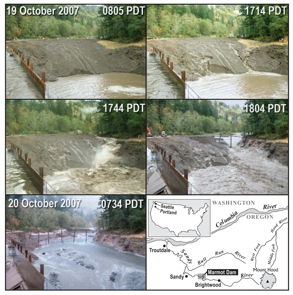
Fig. 1. Location of Sandy River, Marmot Dam and time-lapse images of breaching of the temporary earthen dam. The first image, at 0805 Pacific daylight time (PDT), was taken before the pumps dewatering the earthen dam were removed. Shortly after the pumps were shut off, water began seeping through the dam, gradually triggering small mass failures. Once all of the pumps were removed, crews carved a small notch in the dam crest and released the impounded water. Note the seepage and mass failures on the dam's downstream face evident by 1714 PDT, the channel and small knickpoints that developed as water overtopped the dam after it was notched, and the migrating headcut in the reservoir following breaching. By the following morning, the earthen dam and a substantial volume of stored sediment had been removed. Exposed well casings are about 10 meters tall. Note people for scale in some images. Data shown in Figure 2 were collected at U.S. Geological Survey gauging stations near Brightwood, Oreg., and 450 meters downstream of Marmot Dam. Portland, Oreg., is located 20 kilometers west of the Sandy River/ Columbia River confluence.

Bed load transport also increased following breaching, but its response was slower than for suspended sediment. Bed load flux below the dam site increased from approximately 1 kilogram per second before breaching to 60 kilograms per second by 6 hours after breaching and to about 70 kilograms per second by 18 hours after (Figure 2d), in