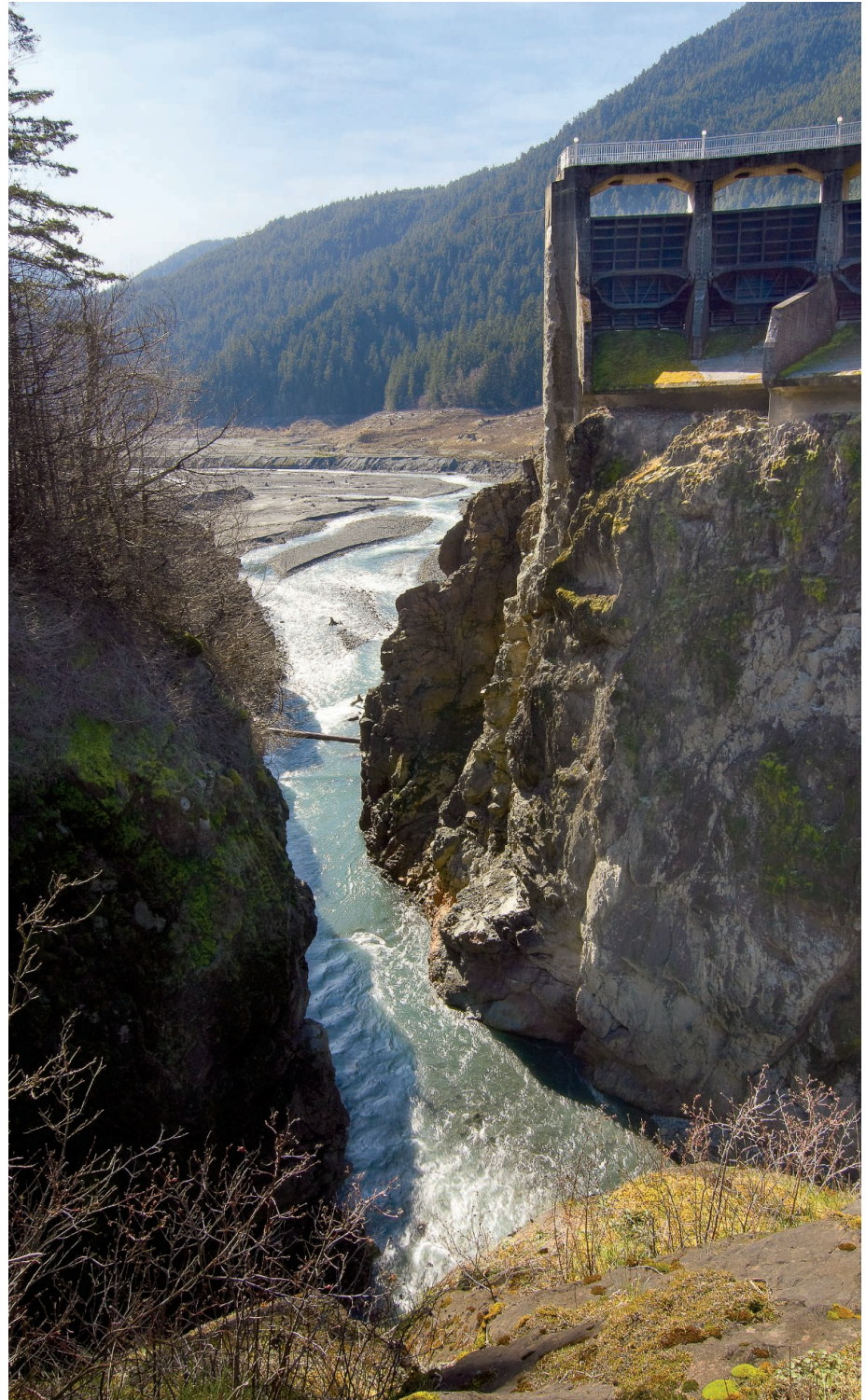
Goodbye to a large dam. Elwha River passing through the remains of Glines Canyon Dam on 21 February 2015. The former Lake Mills can be seen in the background.

A major finding is that rivers are resilient, with many responding quickly to dam removal. Most river channels stabilize within months or years, not decades (4), particularly when dams are removed rapidly; phased or incremental removals typically have longer response times. The rapid physical response is driven by the strong upstream/downstream coupling intrinsic to river systems. Reservoir erosion commonly begins at knickpoints, or short steep