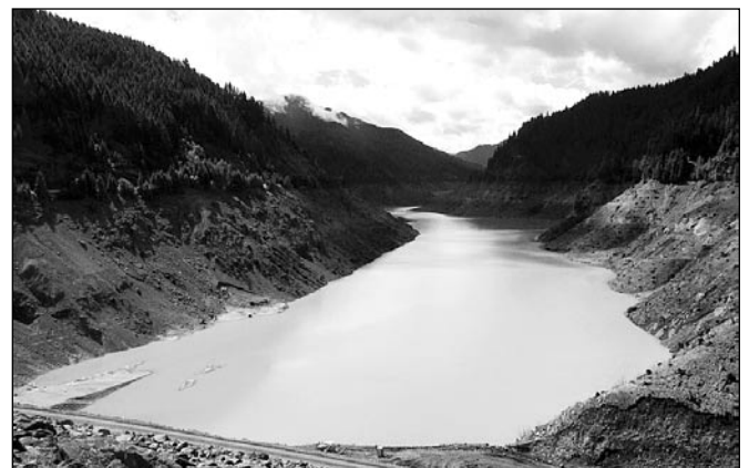
The water was visibly "muddy" in Cougar Reservoir during drawdown.

"The drawdown exposed the delta to below-normal low water levels, a delta that had built up over the 40 years of the dam's life," Grant explains.