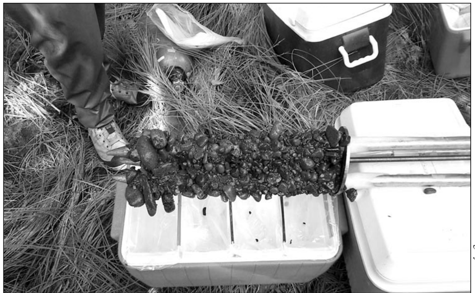
Freeze core or “gravel popsicle” taken from the South Fork of the McKenzie River below Cougar Reservoir. This river bed sediment was analyzed for grain size and clay mineralogy by X-ray diffraction.

with distance below the dam. The mineralogical character of in-stream gravels in the McKenzie River varies dramatically with location along the river, he explains.