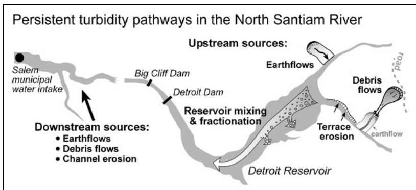
Debris flows and earthflows contain smectitic clays, which muddied Detroit Reservoir, and became concentrated in the water delivered downstream to Salem.

“Water, water everywhere, nor any drop to drink.”