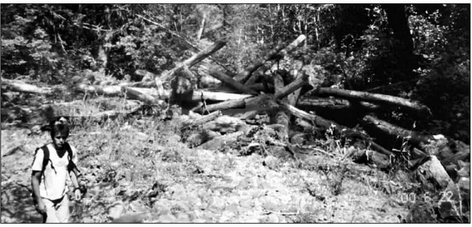
Big jams of wood within debris flows impound sediment, which is then slowly released into the stream over many years.