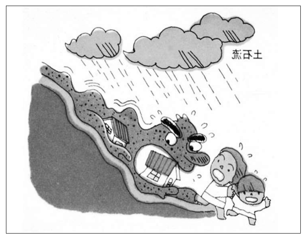
In Japan, street signs warn residents when they are in the "runout zone" of a debris flow translated literally from the Japanese characters as "sludge dragons."

"Everything in nature contains all the power of nature." —Ralph Waldo Emerson