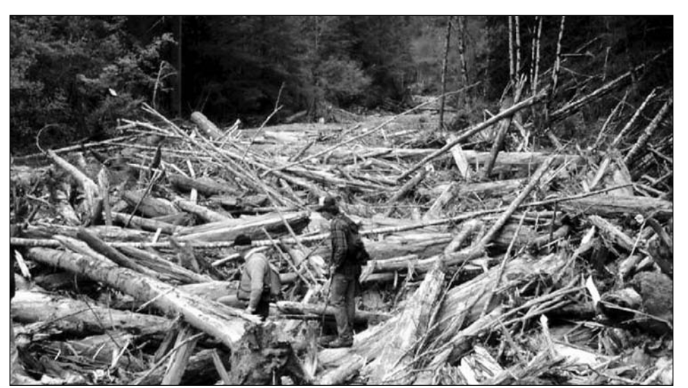
Wood accumulating at the front of debris flows often becomes a sediment dam.

The physics-based portion of the model shows two primary ways wood reduces the velocity of debris flows. First, simply having to push wood along, as it is battered by the stream channel, reduces the total momentum of the flow. And second, changes in flow direction as the "sludge dragon" zigzags through mountain valleys cause wood to collide with basin walls, which absorbs some of the total energy, reducing the debris flow's speed.