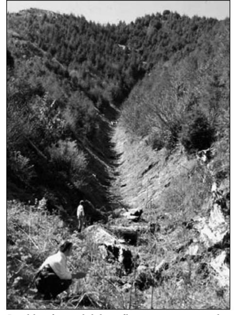
Boulder-fronted debris flow can persist in the channel for a long time after deposition, even after nearly all the wood has decayed.

among multiple objectives for forest and stream management," says Grant.