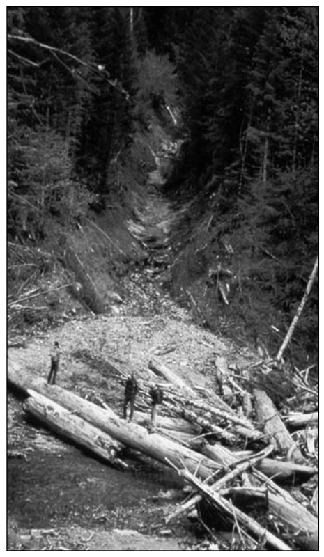
Wood-fronted debris often scours stream channels.

For a long time, it was generally assumed that most logs in streams came from trees located on streambanks. Indeed, this is one of the rationales for retaining narrow riparian buffer strips after logging. However, over the past few years, a debate has been simmering in the scientific literature about whether the